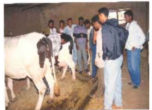
Demonstration in the college dairy farm

The College has formulated two themes. Sustainable Agricultural Production, covering experimental and modelling research to understand processes influencing crop production and vegetation growth in terms of water and nutrient availability at various spatial levels; and Integrated Watershed Management by which watershed areas will