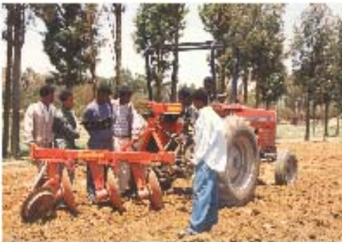
Tractor demonstration at the college farm

Partner institutions can also help in identifying priorities and developing infrastructure as well as establishing links with funding agencies.