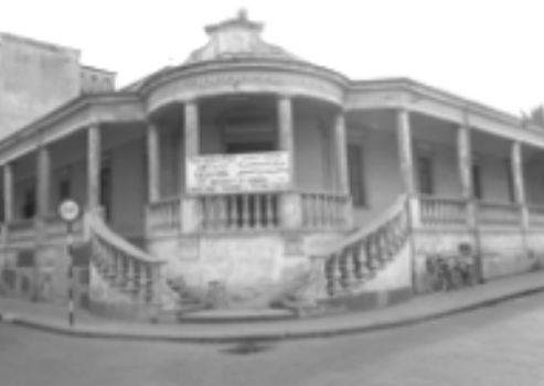
The CTTC Building

try, and our new University Extension Programs and Computer and IT courses offer opportunities to advance skills at every level.”